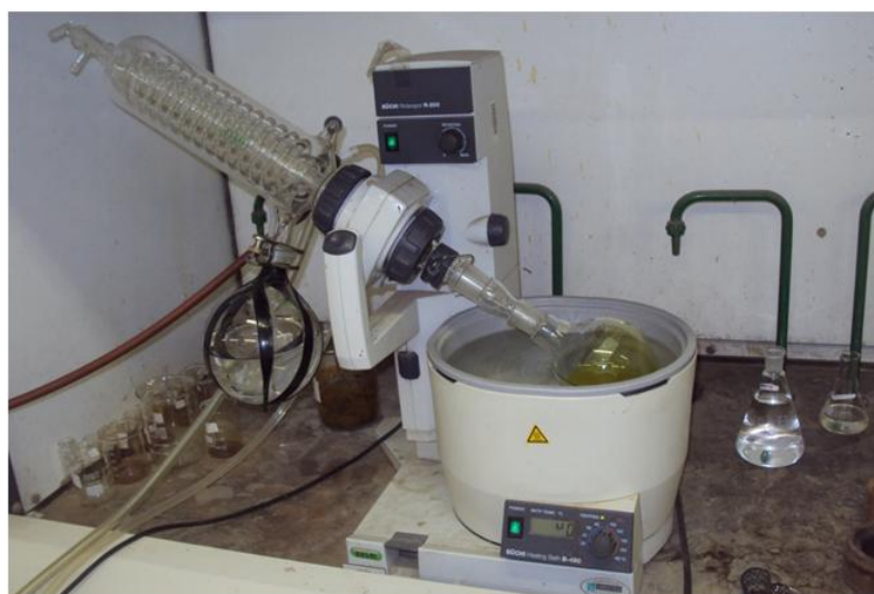
Figure 1. Rotavapor.

Crude marula oil extract from solvent extraction was used in its natural state for fatty acid profile analysis. The oil will be converted into biodiesel by transesterification process in the second phase of the study, and the fatty acid profile analysis will be repeated to compare changes in properties. The composition of marula nut oil was analysed using the Waters GCT premier Time of Flight (TOF) mass spectrometer coupled to the Agilent 6890 N gas chromatograph system. The instrument has high sensitivity and fast acquisition rates. In addition, the National Institute for Standards and Technology (NIST) developed Automated Mass Spectral Deconvolution and Identification System (AMDIS) software package, ( chemdata.nist.gov/mass-spc/amdis ) was used for peak identification. AMDIS extracts spectra for individual components in a GC-MS data file and identifies target compounds by matching these spectra against a reference library, in this case the NIST library. AMDIS also allows