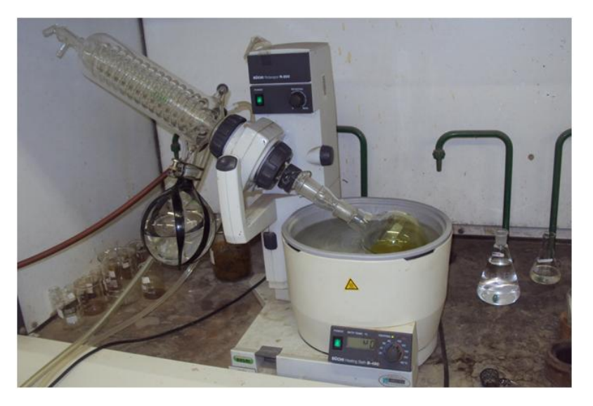
Figure 1. Rotavapor.

Crude marula oil extract from solvent extraction was used in its natural state for fatty acid profile analysis. The oil will be converted into biodiesel by transesterification process in the second phase of the study, and the fatty acid profile analysis will be repeated to compare changes in properties. The composition of marula nut oil was analysed using the Waters GCT premier Time of Flight (TOF) mass spectrometer coupled to the Agilent 6890 N gas chromatograph system. The instrument has high sensitivity and fast acquisition rates. In addition, the National Institute for Standards and Technology (NIST) developed Automated Mass Spectral Deconvolution and Identification System (AMDIS) software package, (chemdata.nist.gov/mass-spc/amdis) was used for peak identification. AMDIS extracts spectra for individual components in a GC-MS data file and identifies target compounds by matching these spectra against a reference library, in this case the NIST library. AMDIS also allows