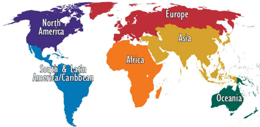
Figure 1. Sigma Theta Tau International's global regions.

The following section describes findings from an STTI service-related nursing survey. These survey results are followed by the ISTF recommendations for service engagement.