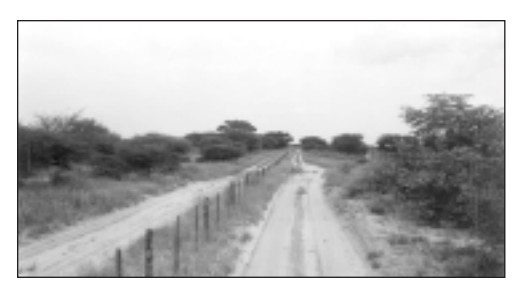
Figure 3—The Southern Buffalo Fence.

The Buffalo Fence is one of the important fences in Botswana in that it controls the spread of foot-andmouth disease in the Okavango Delta region. The Buffalo Fence runs from the south to the north of the Okavango Delta. The fence has succeeded in keeping buffalo populations, which are known for transmitting foot-andmouth, within the inner parts of the delta separate from cattle populations that remain in the outer parts of the country. The Buffalo Fence is divided into the Southern Buffalo Fence erected in 1982 and the Northern Buffalo Fence erected in 1996. The