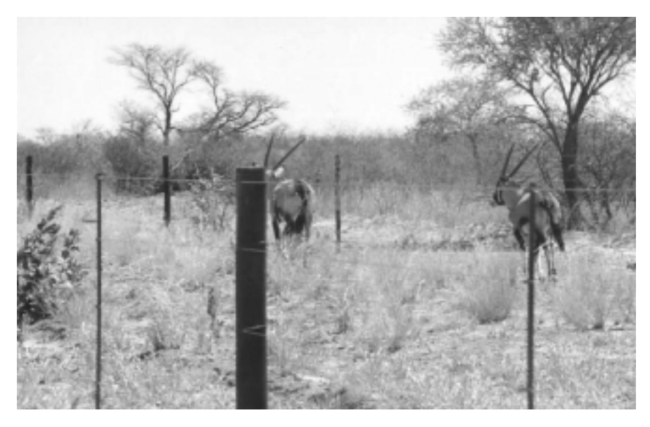
igure 6—Gemsbok between fence lines in 1998 (Kalahari Conservation Society 2005).

(p. i). The Kalahari Conservation Society study further indicated that the removal of the Setata Fence has led to free movement of wildlife over the old fence as shown by seasonal migrations of elephants, zebras, and wildebeests. In addition, gemsbok and hartebeest populations observed in 1997 and 1998 comprised very small, scattered adults of fewer than five animals or sedentary lone adults or calves. Those herds in 2005, after the fence was removed, were typically larger and more cohesive, with numbers and age structures within normal ranges. With regard to the Nxai Pan Buffalo Fence, the study assumed that wildlife populations, particularly elephants, buffalo, and zebras, are likely to return to prefencing levels over the long term. These results indicate that wildlife populations in the Okavango Delta can be reversed if some of the veterinary fences were to be removed.