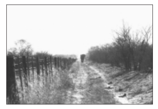
Figure 4—An elephant bull walking along the northern Buffalo Fence in November 1997. The bull has been separated from the rest of the herd by the fence (Kalahari Conservation Society 2005).

Buffalo Fence is reportedly one of the most destructive fences to migratory wildlife species in the region (Albertson 1998). The fence cuts across an area that is described to be a major route for migratory wildlife species to and from dry and wet (Okavango Delta) areas. Albertson (1998) stated that the Northern Buffalo Fence not only cuts off the larger migratory patterns of zebras, wildebeests, and elephants, but also fragments and restricts the movements of localized populations whose territories it bisects (see figure 4). Albertson indicated that wildlife species mostly affected are eland, roan, sables, tsessebes, and giraffes.