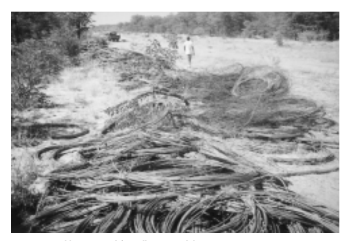
Figure 7—Cables prepared for collection (Kalahari Conservation Society 2005).