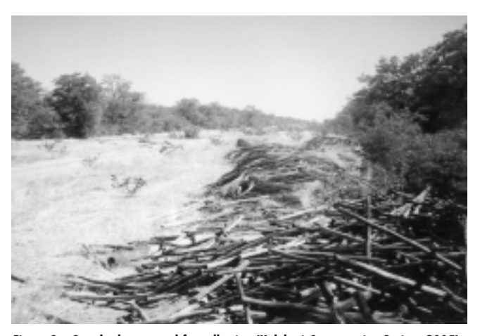
Figure 8—Standards prepared for collection (Kalahari Conservation Society 2005).

with funds by the European Union through the Cotonou Agreement (Perkins 1996; Perkins and Ringrose 1996, Grag Gibson/Environmental Investigation Agency 2004). The involvement of the European Union in Botswana's beef industry is part of globalization and international trade. Globalization and international trade are important in the economic development of any country; however, they also encourage development programs and strategies that can cause negative environmental impacts. The case of veterinary fences and wildlife decline in Botswana is one example of this phenomenon. Instead of promoting the sustainable use of Botswana's wildlife resources, globalization and international trade are thus contributing to the depletion of its wildlife resources. This problem can partly be addressed by encouraging livestock policies and programs that adhere to principles of sustainability in Botswana. This can partly be achieved through the integration of wildlife management and livestock production programs. This approach means that none of these sectors (livestock and wildlife) should be given priority to the detriment of the other, as is the case with the erection of veterinary fences.