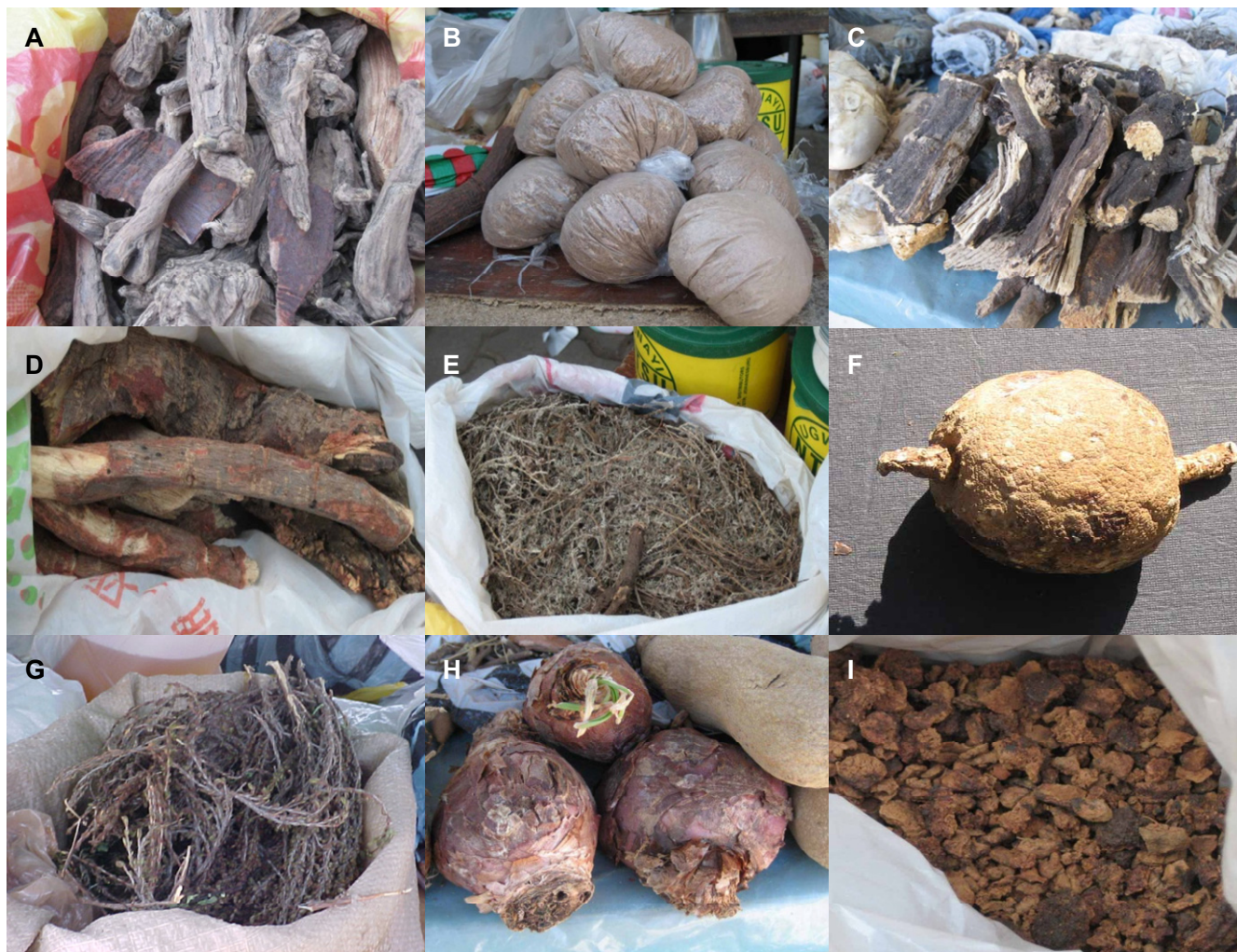
Fig. 2 Photographs of some of the herbal medicines: Hirpicium bechuanense (A), Cassia abbreviata subsp beareana (B), Cadaba aphylla (C), Capparis tomentosa (D), Helichrysum paronychioides (E), Jatropha erythropoda (F), Myrothamnus flabellifolius (G), Urginea sanguinea (H), Dicoma anomala (I).

(5 species), Euphorbiaceae (4 species), and Curcubitaceae (3 species). Other families with low numbers are listed below: Amaryllidaceae, Aspragaceae, Capparaceae, Lamiaceae and Pedaliaceae (2 species), Apiaceae, Apocynaceae, Asphodelaceae, Bignoniaceae, Combretaceae, Commelinaceae, Convolvulaceae, Ebenaceae, Hyacinthaceae, Hydrocharitaceae, Hypoxidaceae, Myrothamnaceae, Pittosporaceae, Plumbaginaceae, Poaceae, Rhamnaceae, Rubiaceae, Rutaceae, Solanaceae, and Tiliaceae (1 species). A photo sample of the herbal medicines is shown in Fig. 2 .