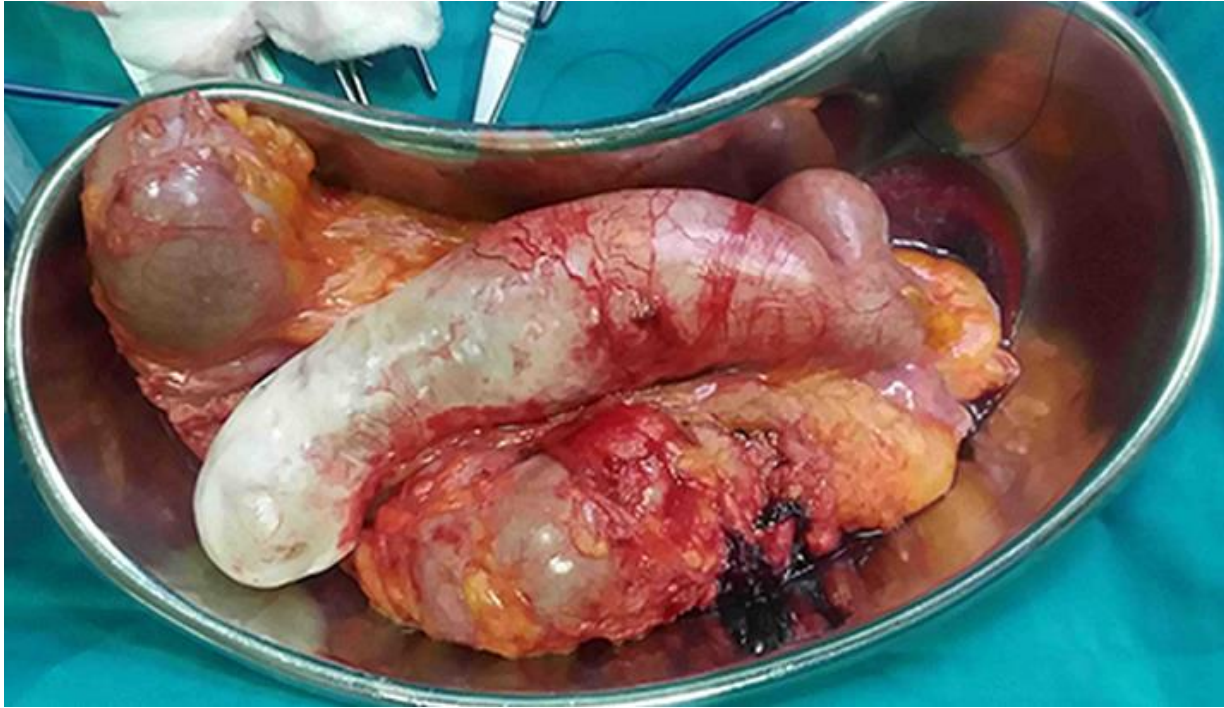
Figure 2: Surgical specimen