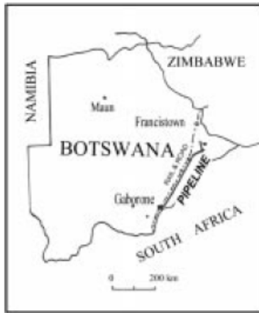
Fig. 1. North-south water carrier.

Major factors in this lack of success are the small size of the local market for manufactured goods, the lack of an appropriately skilled workforce and the closeness of established manufacturing centres in Gauteng and the rest of South Africa, with which Botswana shares a common customs area. Hence the employment of engineering graduates is dominated by civil engineering consultancy, building services engineering and public utilities, with only small numbers in process plants and factories.